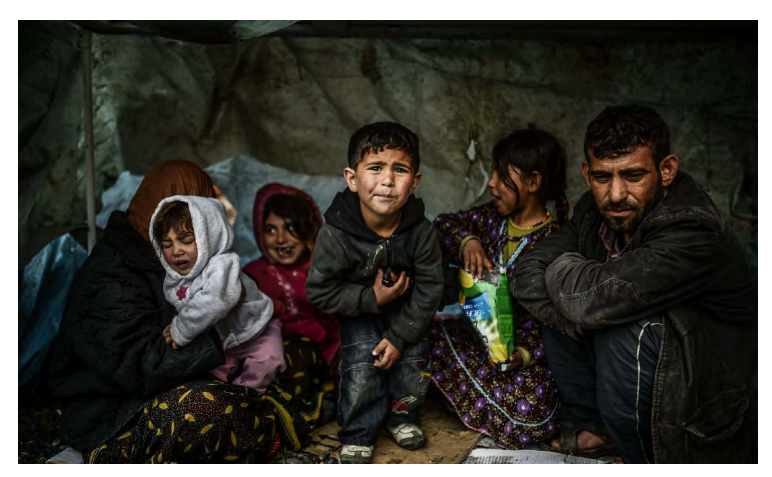
The image is from our Erasmus+ funded The JOURNEY Istanbul project